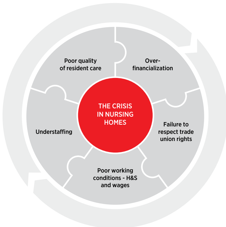
FIGURE 2: The interconnected crisis

As noted in Figure 2, even before the pandemic, the sector faced critical challenges in attracting and retaining sufficient workers to meet the needs for growth of the sector. The OECD has highlighted that this severe shortage of care workers globally stems largely due to the poor quality of jobs. 19 The following key issues in job quality have proved particularly critical in both the response to the COVID-19 pandemic and the long-term needs for workers, residents, and the sector’s long-term needs.